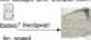
A fragment of stone.

The ancient Egyptians used the hieroglyphs. Hieroglyphs are pictures or symbols that represent words. There are over 700 hieroglyphic symbols. The names of the signs are made the "cartouches". The "Rosetta Stone" helped archaeologists to read hieroglyphs. The symbol represents: PT