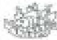
Group of Sheep