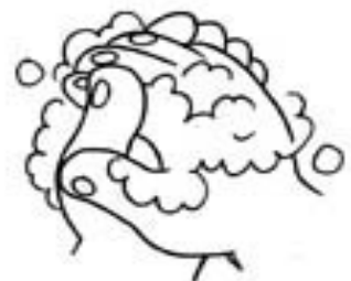
3. Scrub backs of hands, wrists, between fingers, under fingernails.