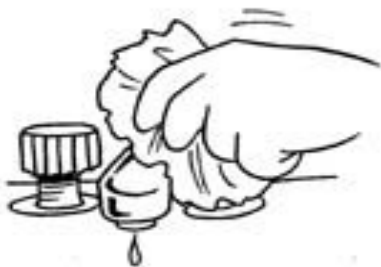
6. Turn off taps with towel