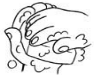
2. Soap (20 seconds)