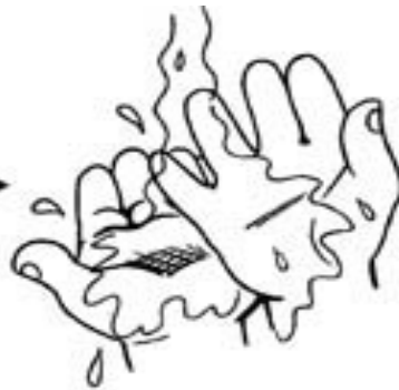
1. Wet hands