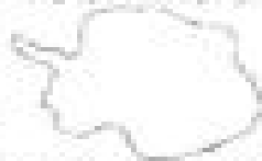
This is Antarctica.

Antarctica is the southernmost continent around the world. It is the coldest and windiest continent. It is _____ kilometers long.