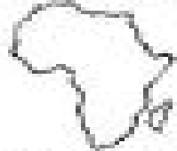
This is Africa.

Africa is the largest continent. There are _____ countries in Africa. It is _____ kilometers long.