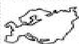
This is Europe.

Europe is the _____ largest continent. There are _____ countries in Europe. It is _____ kilometers long.