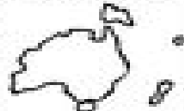
This is Australia.

Australia is the _____ largest continent. It is _____ kilometers long.