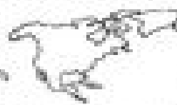
This is North America.

North America is the largest continent. There are _____ countries in North America. It is _____ kilometers long.