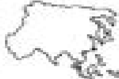
This is Asia.

Asia is the largest continent. There are _____ countries in Asia. It is _____ kilometers long.