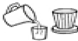
Dissolve in water and then use a filter.