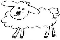
A Lost Sheep