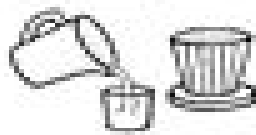
Dissolve in water and then use a filter.