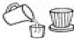
Pour in water and then use a filter.