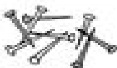
Steel nails and copper nails

On the left, you can see four mixtures. On the right are four different methods for separating mixtures. Draw a line between each mixture and the best separation method. On a separate piece of paper, explain your choice.