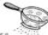
Use a colander.