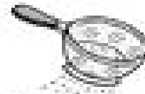
Use a colander.