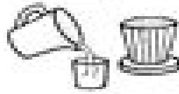
Pour in water and then use a filter.