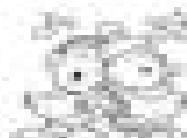
Play with a ball (Play with a ball)