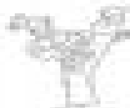
Play with a ball (Play with a ball)