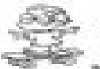
Play with a ball (Play with a ball)