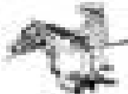
Ride a horse (Ride a horse)