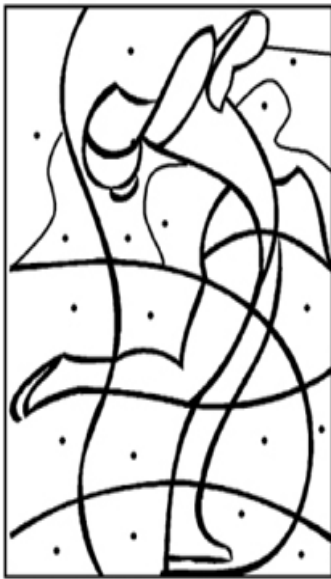
Color the pieces with dots purple to find the hidden picture