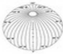
Shows lines of _____