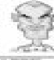
10 DENNIS LEHANE - WRITER, JOURNALIST