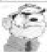
6 LYLE LOVETT - COUNTRY MUSICIAN