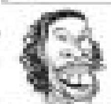
8 BOB DYLAN - SINGER, GUITAR PLAYER