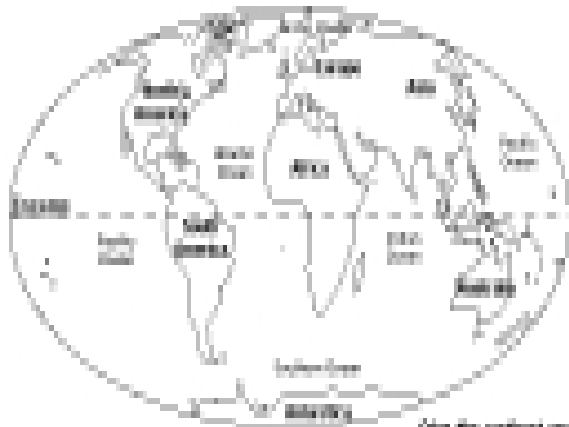
Color the continent you live in red.