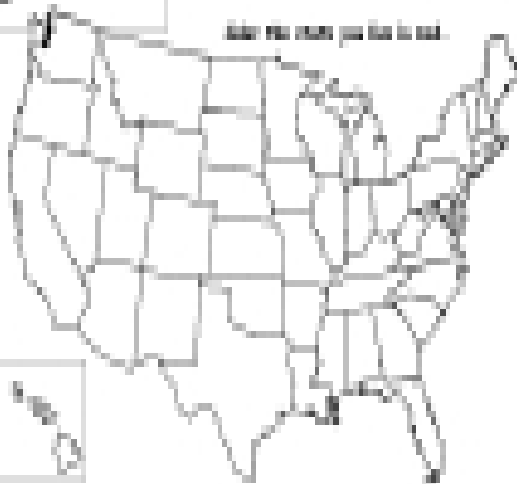
Color the state you live in red.