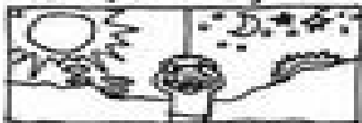
The day has a rhythm to it. Sunrise — Sunset — Sunset — Sunset —