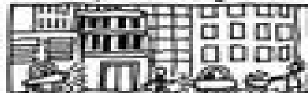
The city has a rhythm.