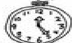
The ticking of a clock is rhythm.