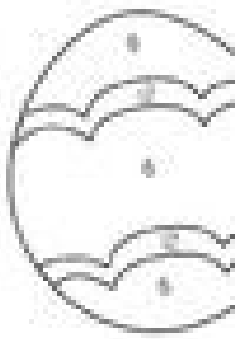
Figure 20 13