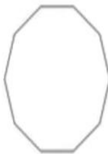
Decagon – 10 sides