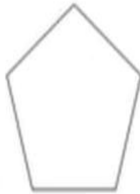
Pentagon – 5 sides