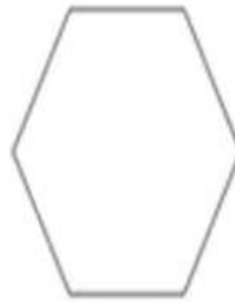
Hexagon – 6 sides