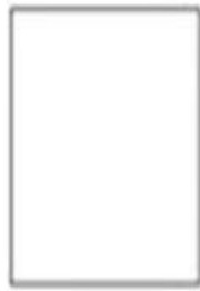
Square – 4 sides