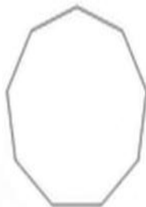
Nonagon – 9 sides