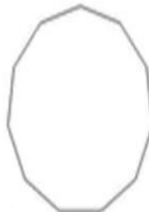
Hendecagon – 11