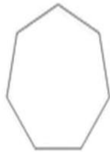
Heptagon – 7 sides