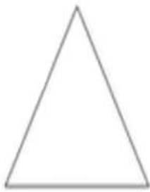
Triangle – 3 sides