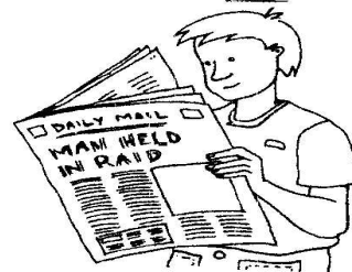
I read the newspaper every day.

We often go to the cinema on Fridays. My parents never eat meat. I get up late at the weekend.