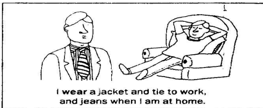
I wear a jacket and tie to work, and jeans when I am at home.