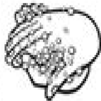
3. Wash for 20 seconds Enjabón las manos por 20 segundos