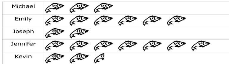
Number of Fish Caught

Michael, Emily, Joseph, Jennifer, and Kevin went on a fishing trip. Look at the pictograph below to see how many fish each person caught. Answer the questions below.