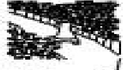
cr _ _ d