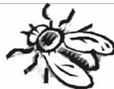
Ee (House Fly)