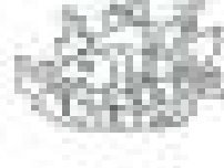
Group of Sheep