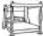
a ball on the bed