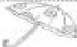
a book under the umbrella