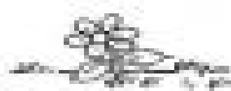
a butterfly over the flower