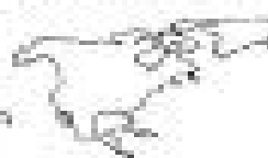
This is North America.

North America is the largest continent. There are 23 countries in North America. It is in the northern hemisphere.