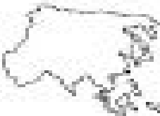
This is Asia.

Asia is the largest continent. There are 49 countries in Asia. It is in the northern hemisphere.