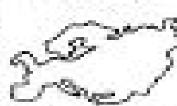
This is Europe.

Europe is the second largest continent. There are 50 countries in Europe. It is in the northern hemisphere.