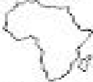
This is Africa.

Africa is the largest continent. There are 54 countries in Africa. It is 14,000,000 square kilometers.