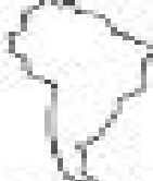
This is South America.

South America is the largest continent. There are 12 countries in South America. It is in the southern hemisphere.