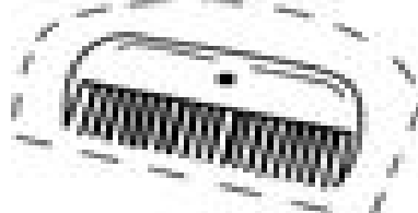
MANE & TAIL COMB