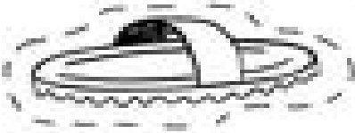
RUBBER CURRY COMB