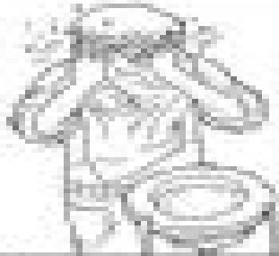
Wash my face