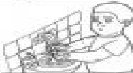
Wash my hands