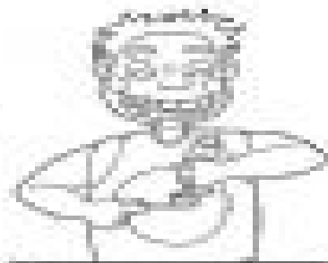
Brush my teeth