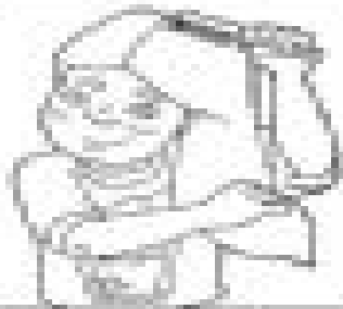
Comb my hair