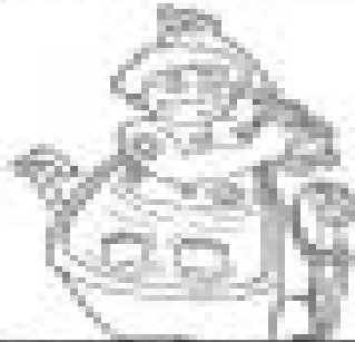
Take a shower