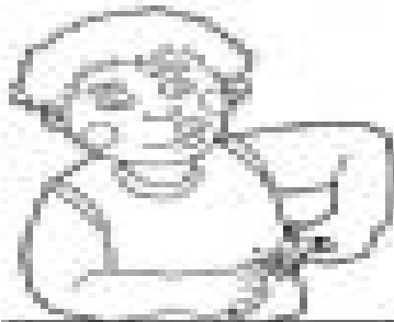
Cut my nails