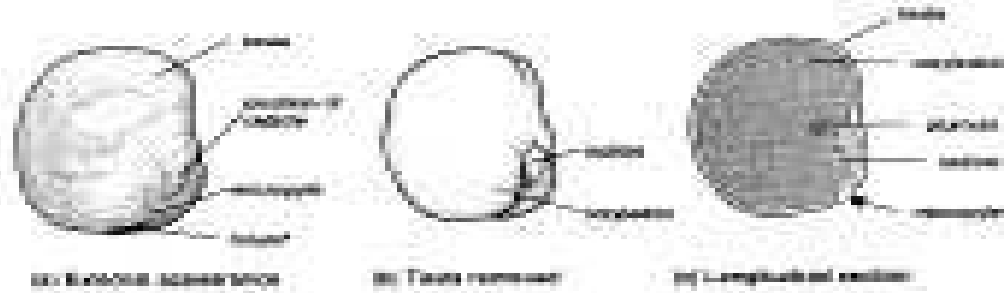
Broad bean seed

To understand seed structure and germination, it is useful if large seeds, such as peas and beans are studied.