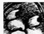
9 circular and dot shapes