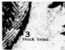
3 thick lines