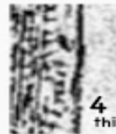
4 thin lines