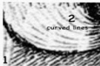
1 straight lines