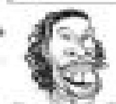
8. RONALDO - SOCCER PLAYER