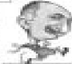
7. DIEGO - ACTOR