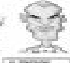
10. RONALDO - SOCCER PLAYER