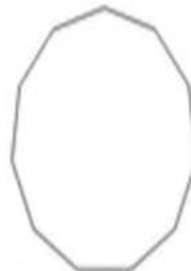
Hendecagon – 11