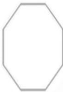
Octagon – 8 sides