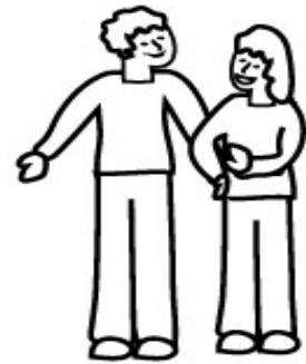
This is my mom and dad.