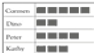
Number of cookies sold

Look at this pictograph. Then answer the questions.