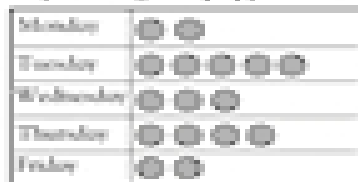
People using the puppet theater

Three people can use the puppet theater at a time = 3 people