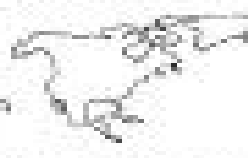
This is North America.

North America is the largest continent. There are 23 countries in North America. It is in the northern hemisphere.