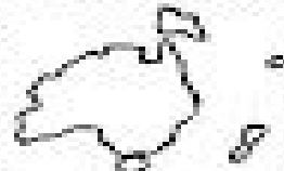
This is Australia.

Australia is the continent in the southern hemisphere. It is the only continent in the southern hemisphere.