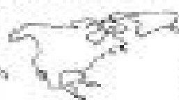
This is North America.

North America is the largest continent. There are 23 countries in North America. It is in the northern hemisphere.