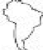
This is South America.

South America is the largest continent. There are 12 countries in South America. It is in the southern hemisphere.