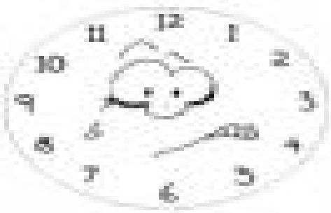
5:00 half-past six