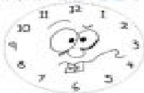
1:00 half-past eight