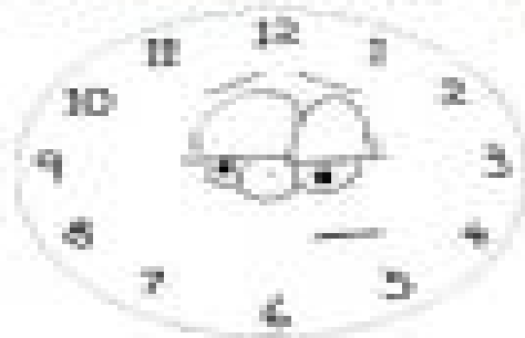
12:00 half-past twelve