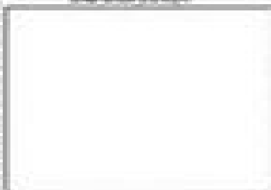
Draw a picture of your invention.

for inspiration and using the genius from the wonderful device to buy a _____