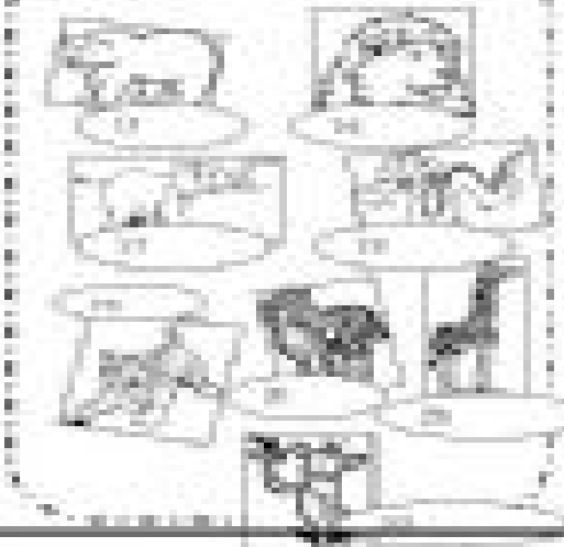
HEAD OF THE ANIMAL