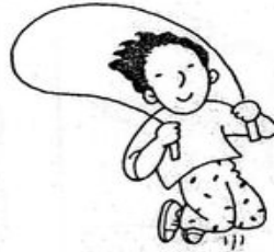
play jump rope