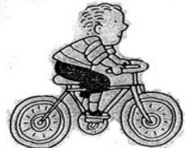
ride a bike