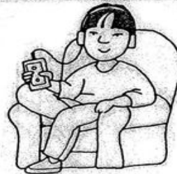
listen to music