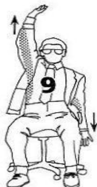
9 8-10 seconds each side