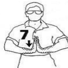
7 10 seconds