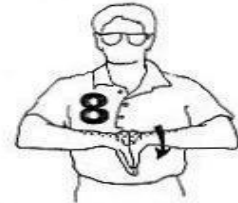
8 10 seconds