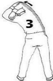
3 8-10 seconds each side