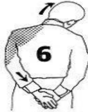
6 10-12 seconds each arm