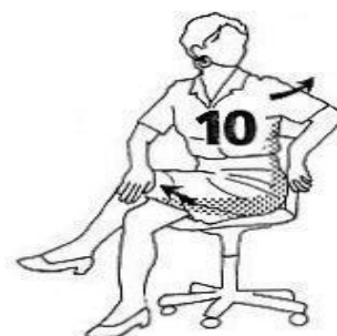
10 8-10 seconds each side