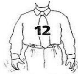
12 Shake out hands 8-10 seconds