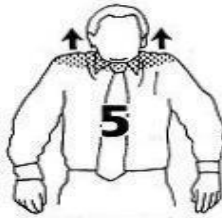
5 3-5 seconds 3 times