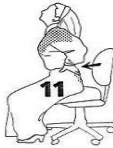
11 10-15 seconds 2 times