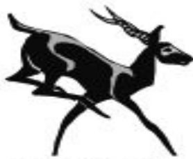
the sympathetic nervous system