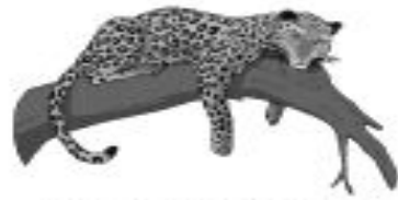
the parasympathetic nervous system