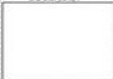
Draw a picture of your invention.

for inspiration and using the genius from the wonderful device to try a _____