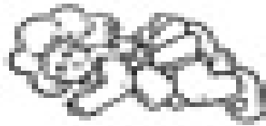
Making my bed