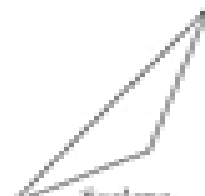
Scalene (all sides different)