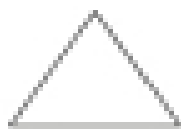
Equilateral (all sides equal, is also isosceles)