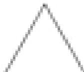
Isosceles (two sides equal)