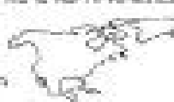
This is North America.

North America is the largest continent. There are 23 countries in North America. It is in the northern hemisphere.