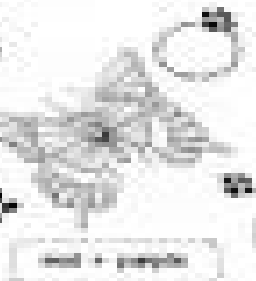
6 - butterfly