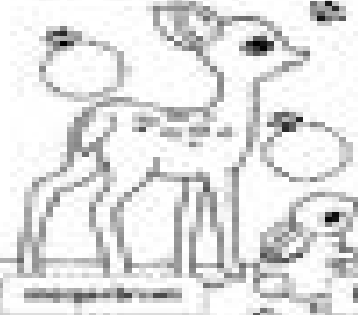
1 - deer