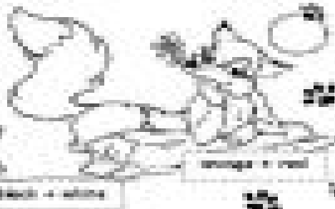
7 - fox