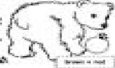
12 - mouse