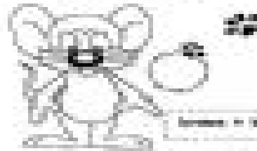
8 - bear