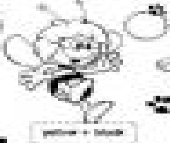
9 - bee