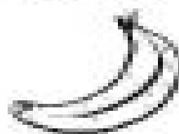
It's a BANANA.