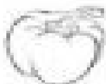
It's a PEAR.