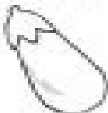
It's an EGGPLANT.