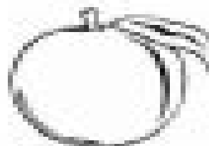
It's a PEACH.