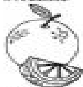
It's an ORANGE.