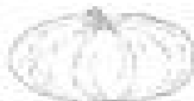
It's a PUMPKIN.