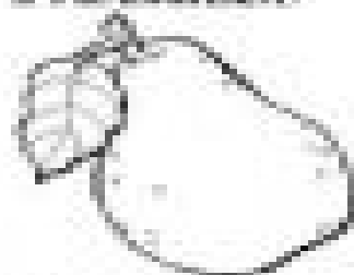
It's a PEAR.