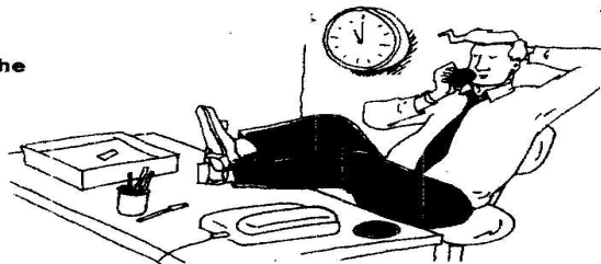
He stops and has a cup of coffee at eleven o'clock.

They have everything you want in that shop. She has a house in St James' Square.