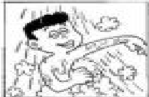
Taking a shower