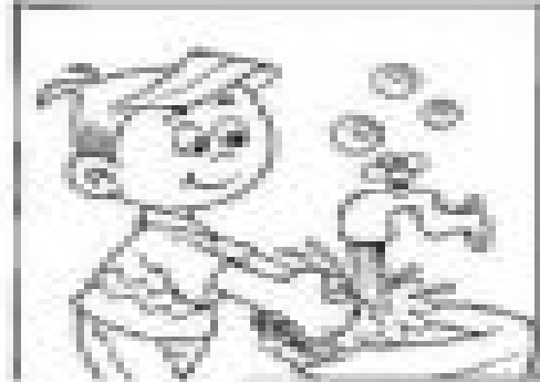
Washing my hands