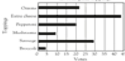
Millbrook School math club Favorite pizza toppings